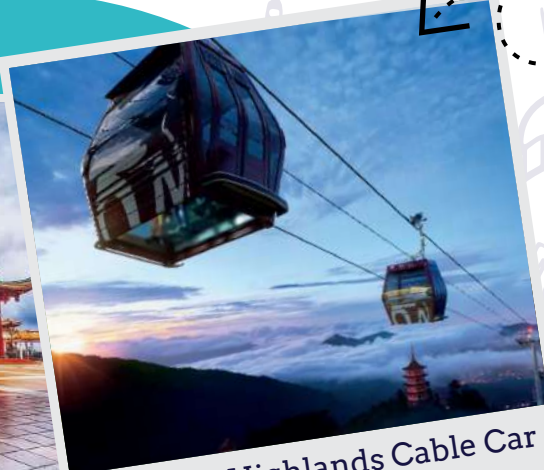
Genting Highlands Cable Car