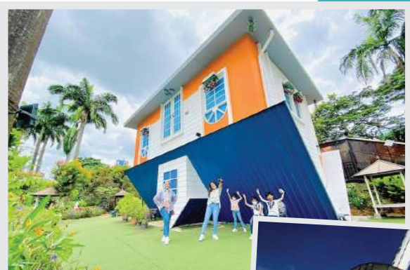
Upside Down House