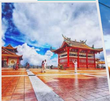
Chin swee Temple